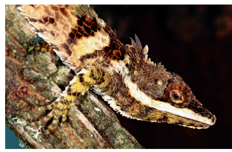
Cophotis ceylanica