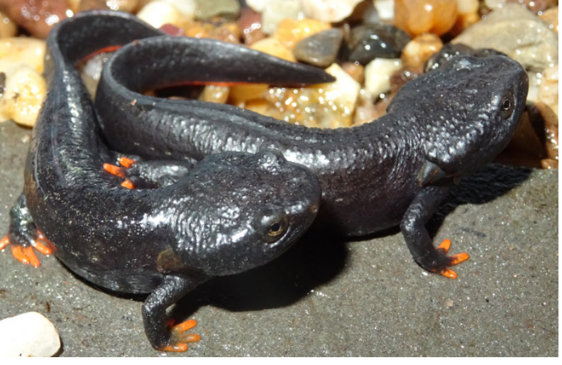
Tylototriton vietnamensis

• Tylototriton spp. (all crocodile newts; currently 30 Taxa, listed in Annex D of Regulation [EC] 338/97 until EU implementation)