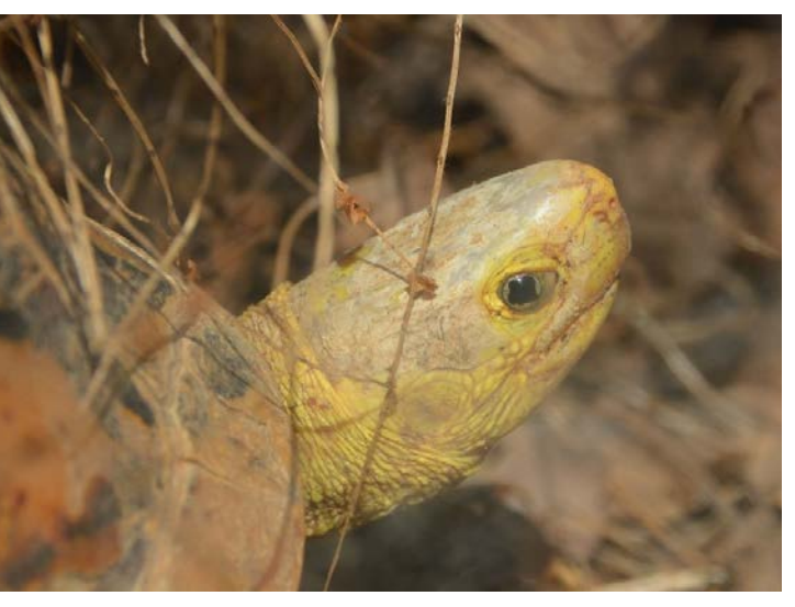
Cuora picturata